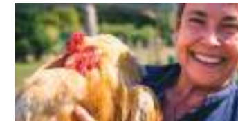
Le Haut-Montmartin, breeding of ornamental hens.

Information and reservations on site in our Tourist Office or online at tourainenature.co.uk