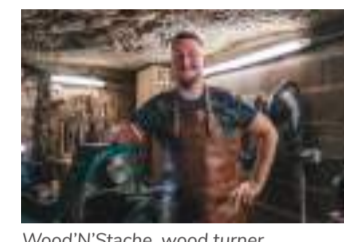
Wood'n'Stache, wood turner.